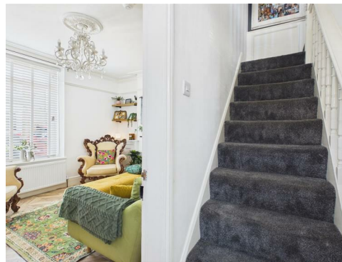
Stairs to the first floor, tiled flooring.