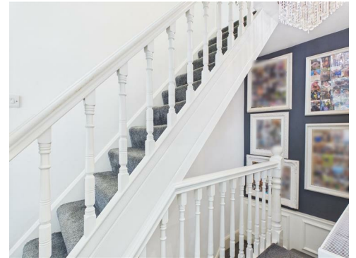
Stairs to the second floor, double glazed window, carpeted flooring.