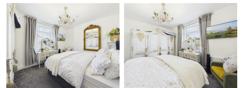
Double glazed window, carpeted flooring, radiator.